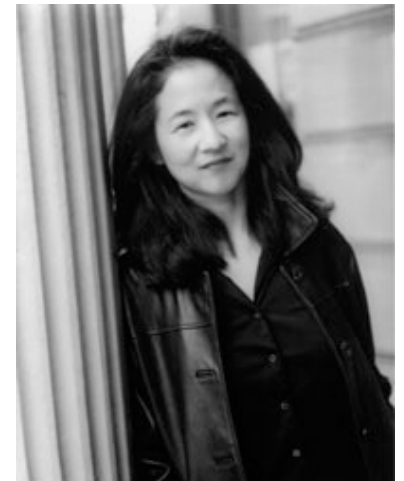
Author Julie Otsuka will visit Cheshire in October 2007.